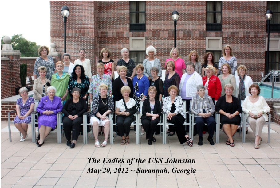
The Ladies of the USS Johnston May 20, 2012 ~ Savannah, Georgia